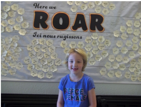
ROAR Winners from March